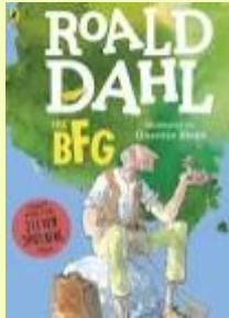
The BFG by Roald Dahl